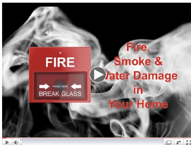
Fire, Smoke & Water Damage in Your Property

CSC recently sponsored a video about fire, smoke and water damage that can be seen here: